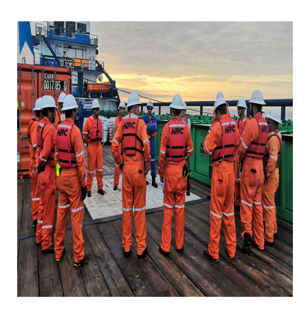
NRC Newsletter Q3 2019